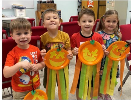
We had a lot of fun during Spirit Week!