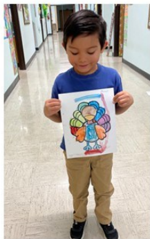
Getting ready for Thanksgiving!