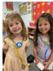
J is for jobs!